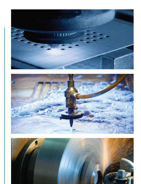
Cutting Methods From the top: Laser Cutting, Water-jet Cutting, Mechanical Cutting.

Milling: The stock is mounted on a movable table that maneuvers around a fixed cutting blade.